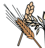
Cereals containing gluten